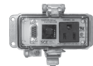
DB9 F/M connector with 120 VAC Simplex outlet & 3 Amp circuit breaker