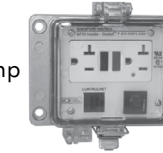
RJ-45 CAT5 F/F connector with 120 VAC Duplex GFCI with internal Simplex GFCI & 3 Amp circuit breaker