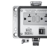
RJ-45 CAT5 F/F connector with 120 VAC Duplex GFCI with internal Simplex GFCI. No circuit breaker