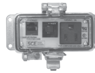
RJ-45 CAT5 F/F connector with 120 VAC Simplex outlet & 3 Amp circuit breaker