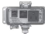
RJ-45 CAT5 F/F connector with 120 VAC Simplex outlet & 3 Amp circuit breaker