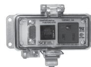
DB9 M/F connector with 120 VAC Simplex outlet & 3 Amp circuit breaker